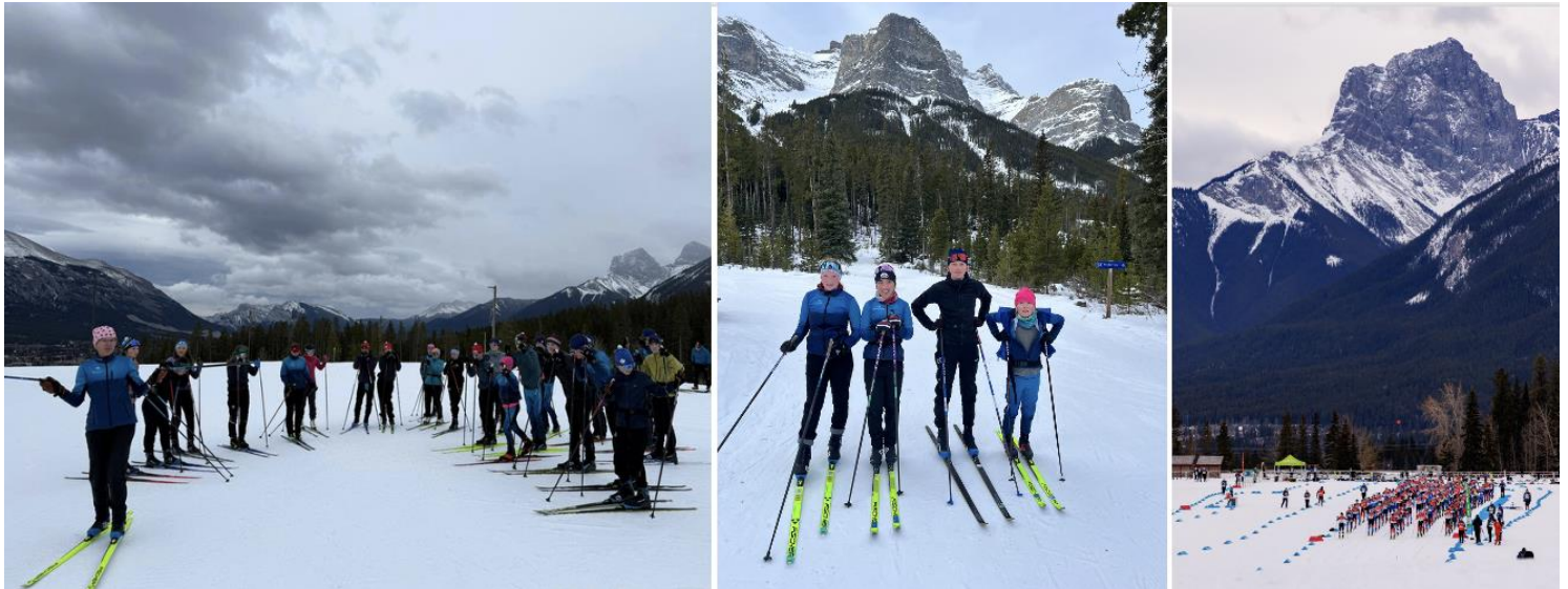
Shots from Canmore, Junior World Trials

Beginning on Thursday, contenders for the 2026 World Juniors, being held in Norway this March, raced a 3 x 3.3 km classic course. They were faced with long & at times steep hills before a long, windy descent to the stadium, starting all over again two more times.