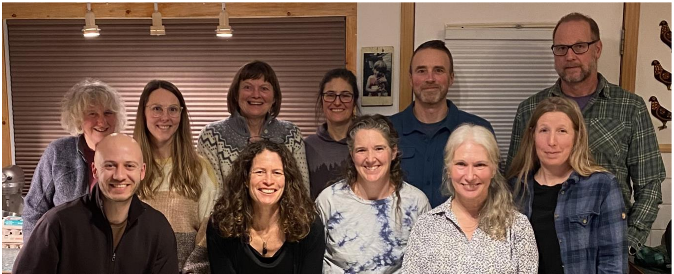
BVCCSC Board of Directors; Look how friendly we are! Join us as our treasurer?